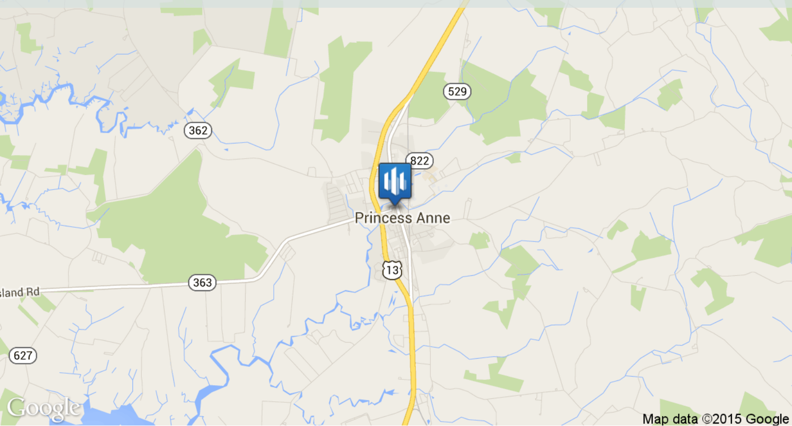
Map data ©2015 Google